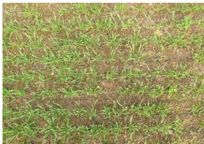
Figure 3: Sufficient biomass for grain recovery

Grazing dual purpose wheat varieties can have the added benefit of reducing lodging and disease as excessive vigour is managed through strategic grazing.